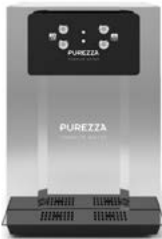
P1 Bar - Series B