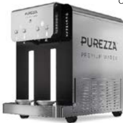
P1 Firewall® Bar Classe Series