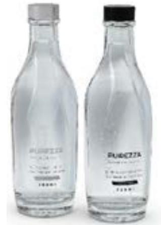
Petalosa Bottle Range Still & Sparkling 750ml and 350ml