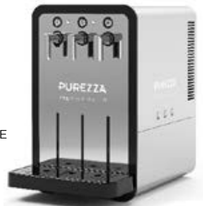
P1 Bar - Series E