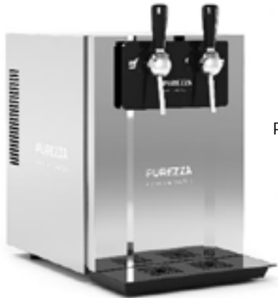
P1 Bar - Series B