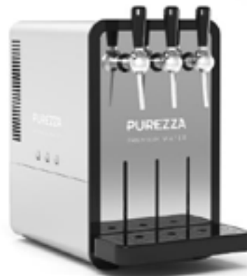
P1 Bar - Series E